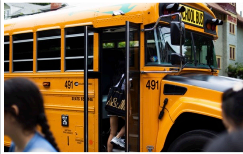
Itbaca City Schools add electric busses.