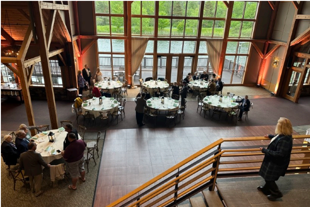
Please scroll through photos from our CNYSBA Annual Dinner